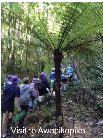
Visit to Awapikopiko

If you haven't already, it would be brilliant if you could find some time to download and sign up to the Seesaw app to access your child's account. Ask them to look through and explain their learning to you. We have included all the details about how to sign up and log in again with this newsletter for those of you who haven't already done this.