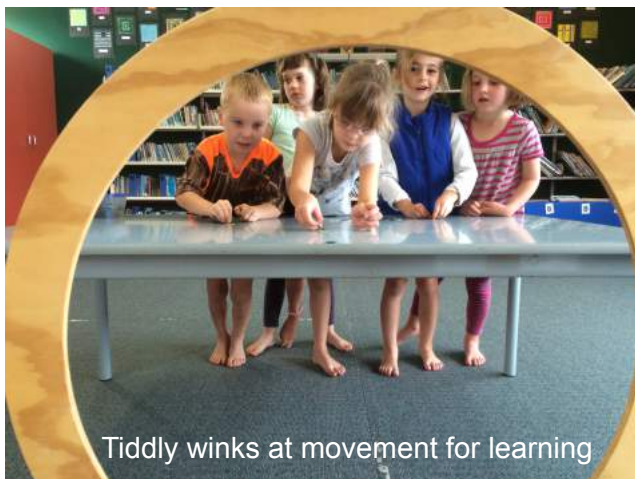
Tiddly winks at movement for learning

School students aged 8 and over. Looking for something different to do in the holidays? Register at Woodville Library for free basic GIF making sessions. Sessions held daily, Monday to Friday, during the school holidays from 2:00pm – 3:00pm. Registrations are limited so bookings essential