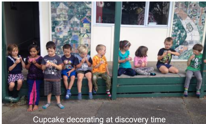
Cupcake decorating at discovery time