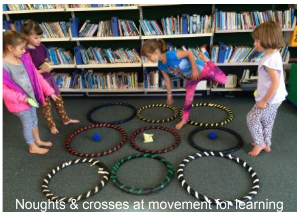
Noughts & crosses at movement for learning