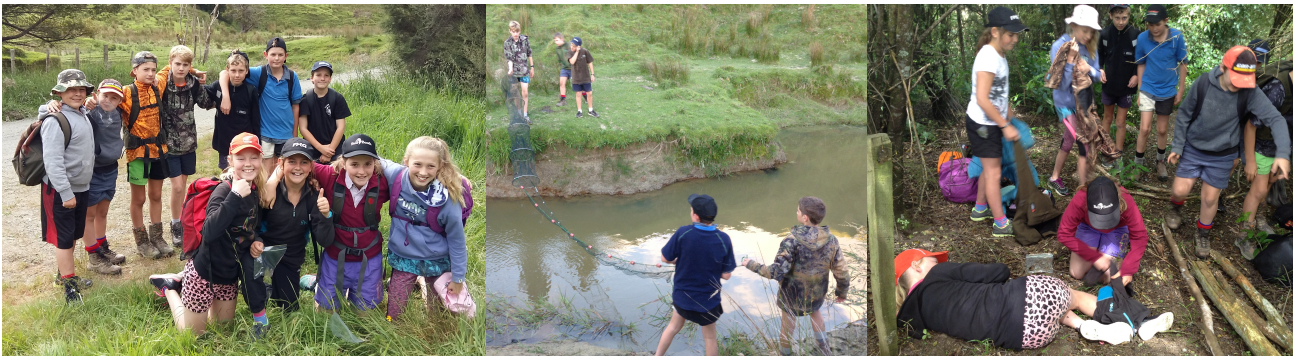
Awapikopiko - Setting the eel net & First Aid Scenario