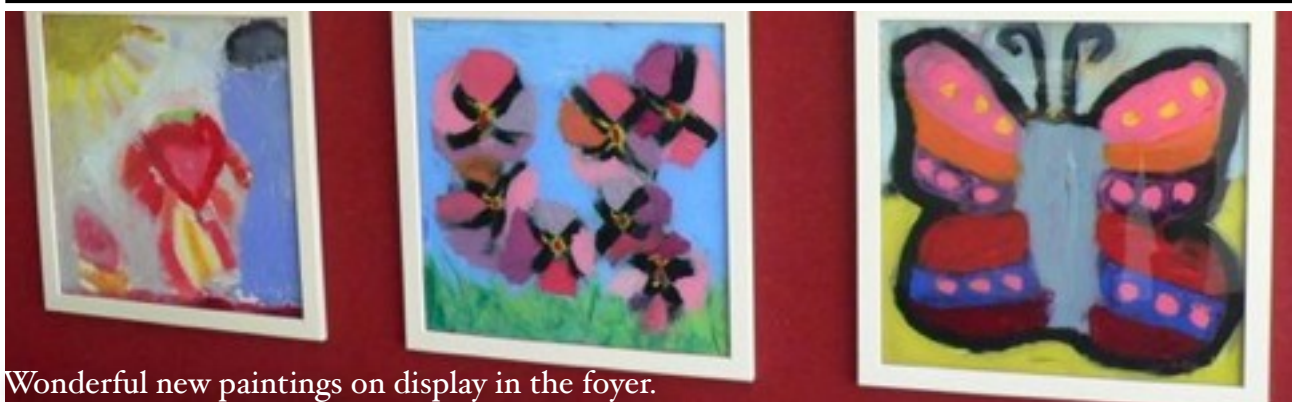
Wonderful new paintings on display in the foyer.