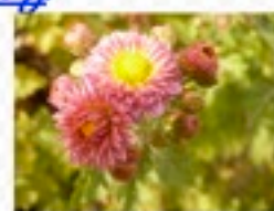
Black and white photos Creative photos e.g photos on this page Family and friend photos