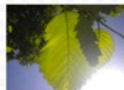
Come and buy our awesome photos at stall 10 tomorrow (13/9/12)

isaacisthebomb1@gmail.com sexeter@kumeroa.school.nz