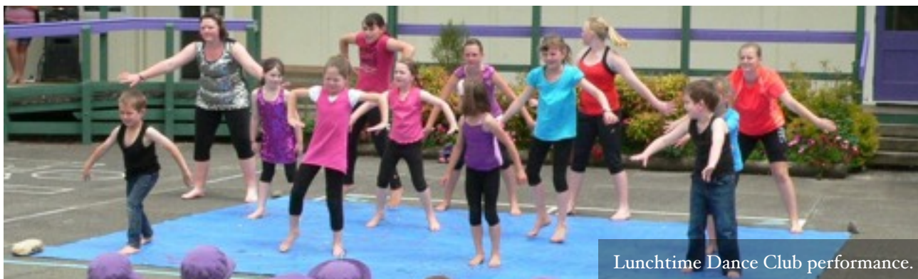
Lunchtime Dance Club performance.