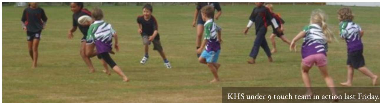
KHS under 9 touch team in action last Friday.