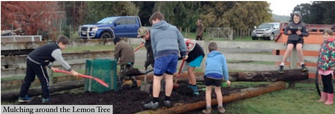
Mulching around the Lemon Tree