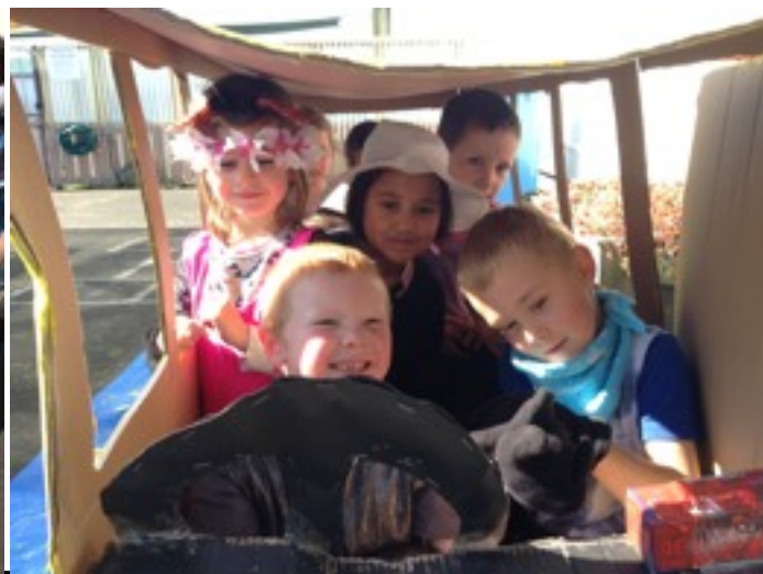
On the Magic School Bus.